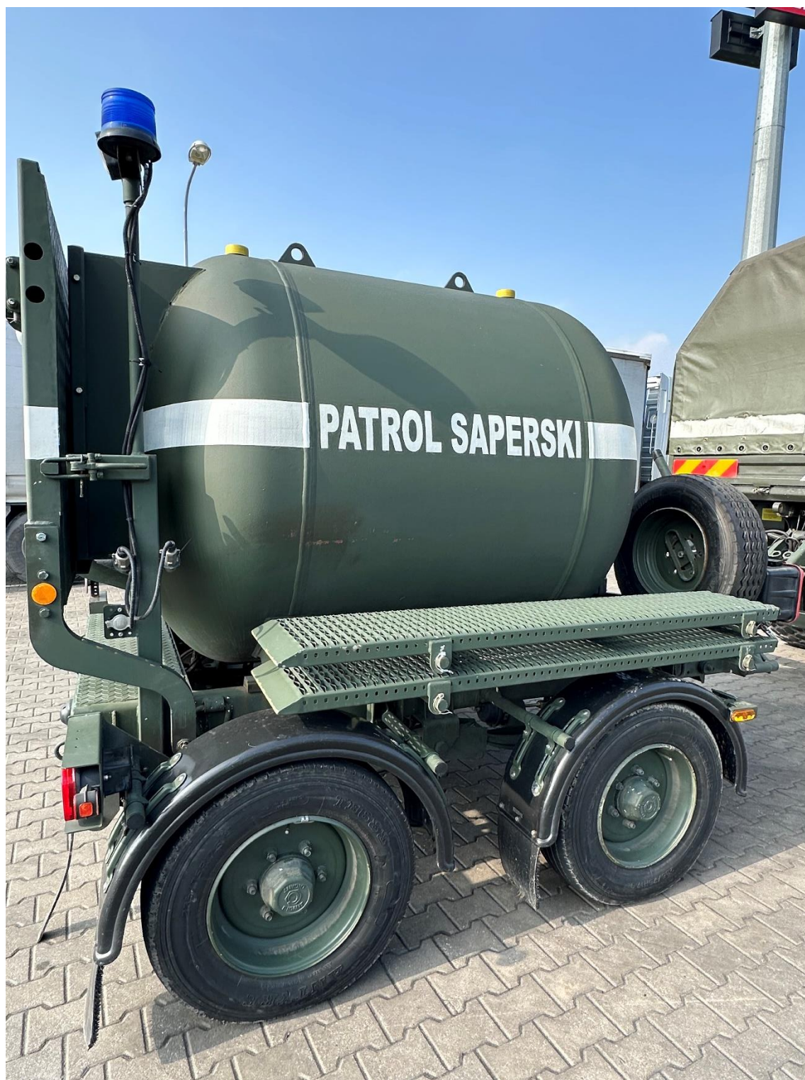
Figure S2. General view of the Wiktoria anti-shrapnel container (right side)