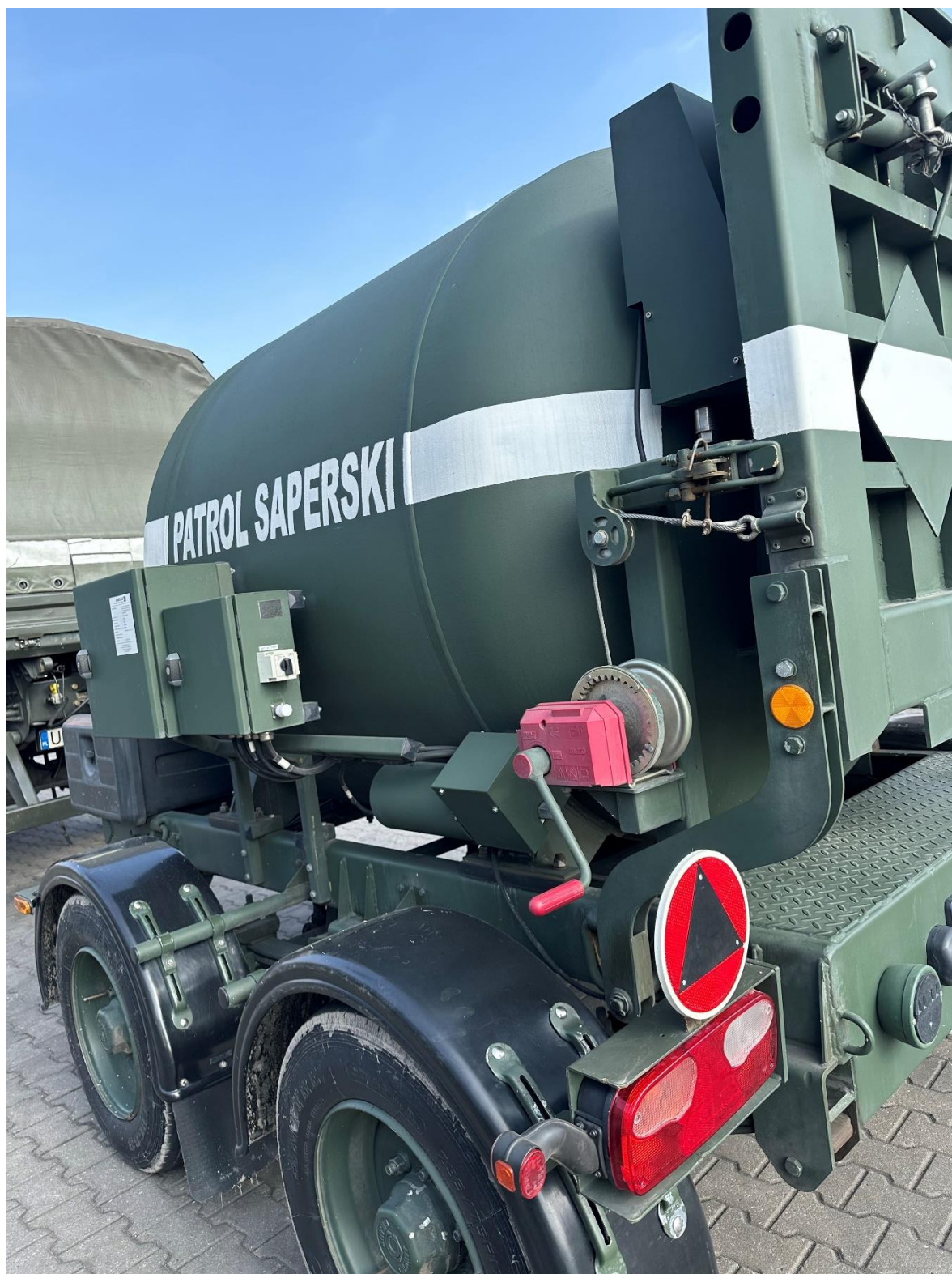
Figure S3. General view of the Wiktoria anti-shrapnel container (from the rear) (This photo is from the authors.)