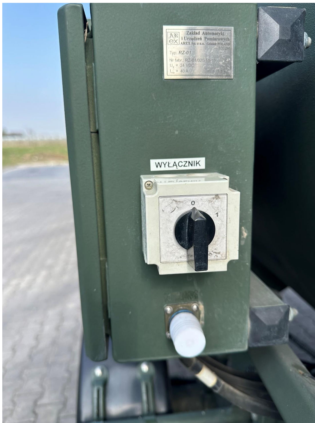
Figure S5. Close-up of the switch shown in Figure S3