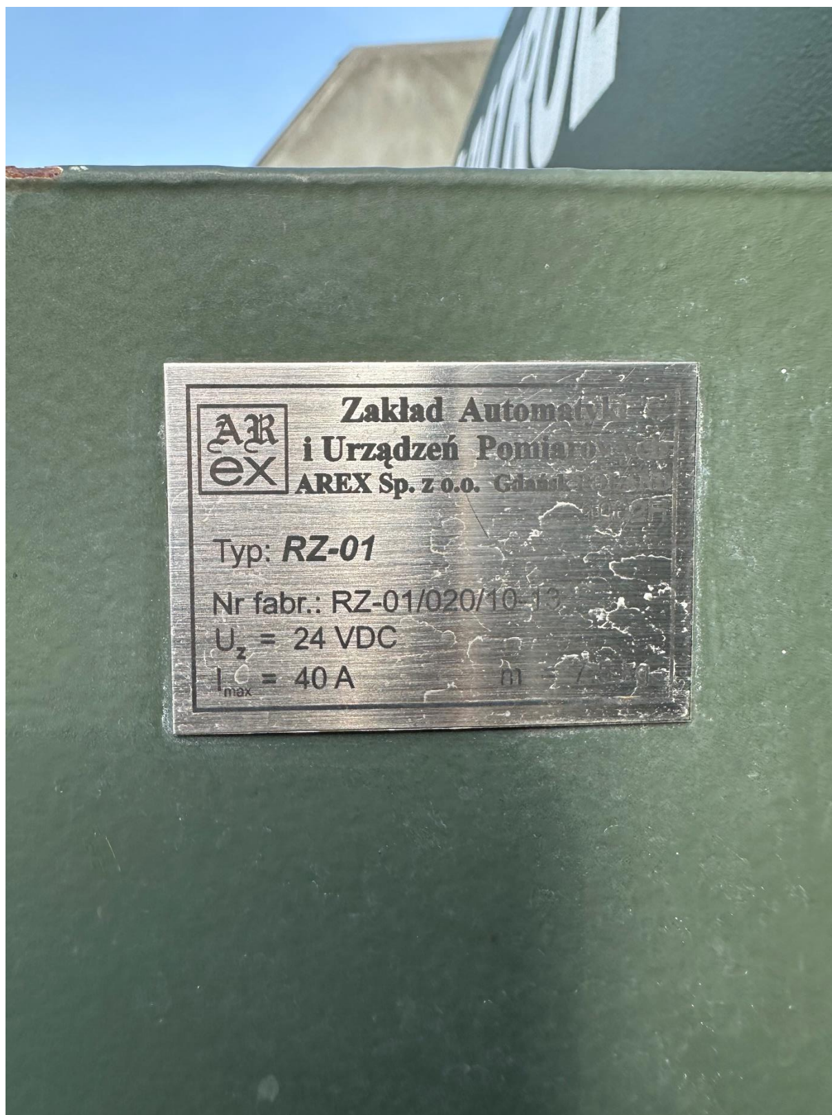
Figure S6. Close-up of the plate shown in Figure S5