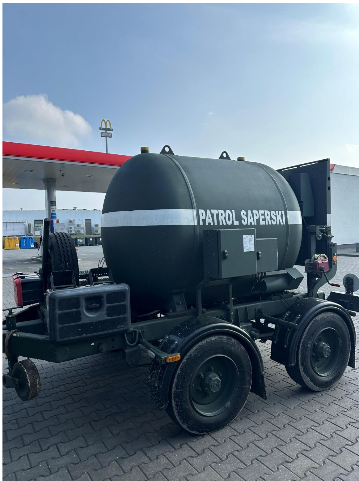
Figure S1. General view of the Wiktoria anti-shrapnel container (left side)